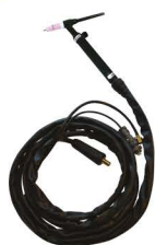
Tig Torch (AWP26V)